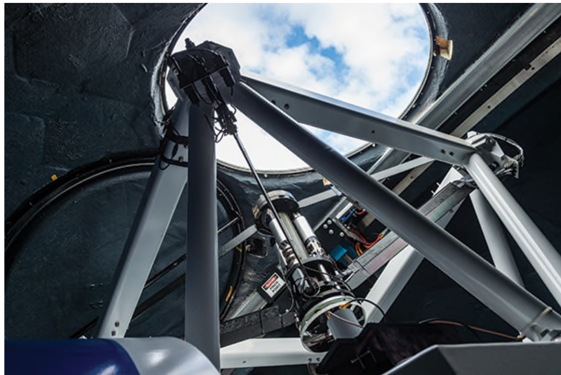
Space situational awareness and debris monitoring