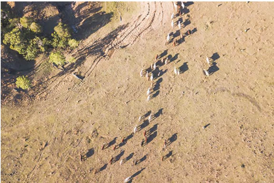
Positioning, navigation and timing