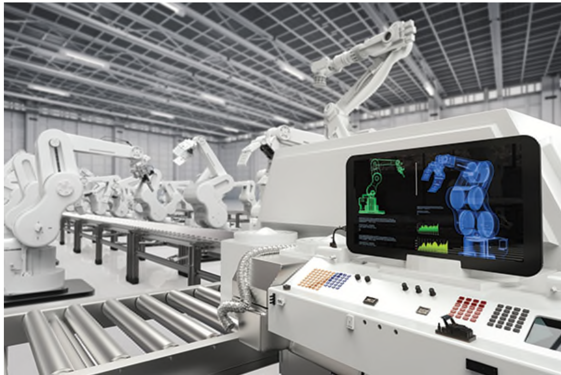
Robotics and automation