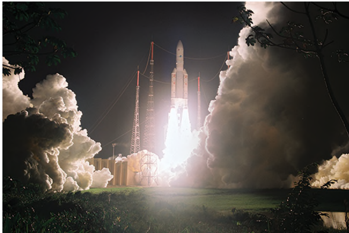
Access to space