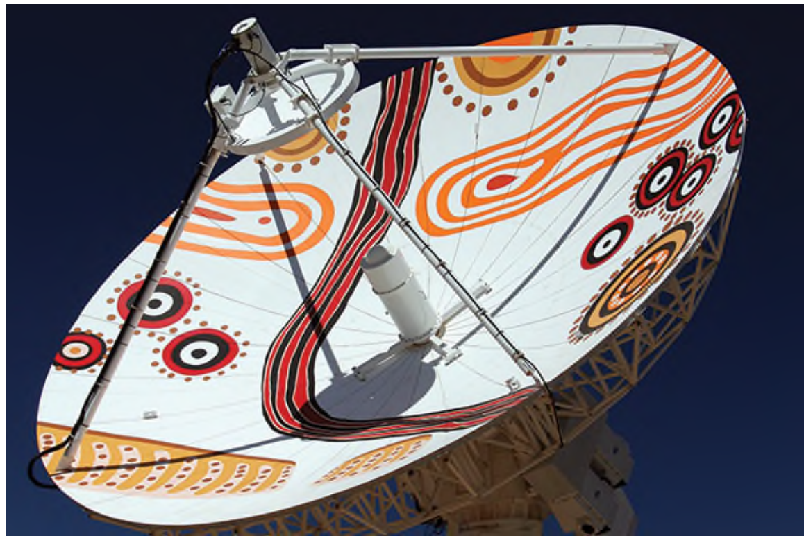
Communications technologies and services